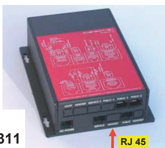
Central unit Ref. 40.054.311