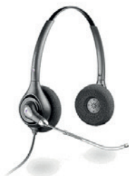
Microphone loudspeaker unit Ref. 40.054.301